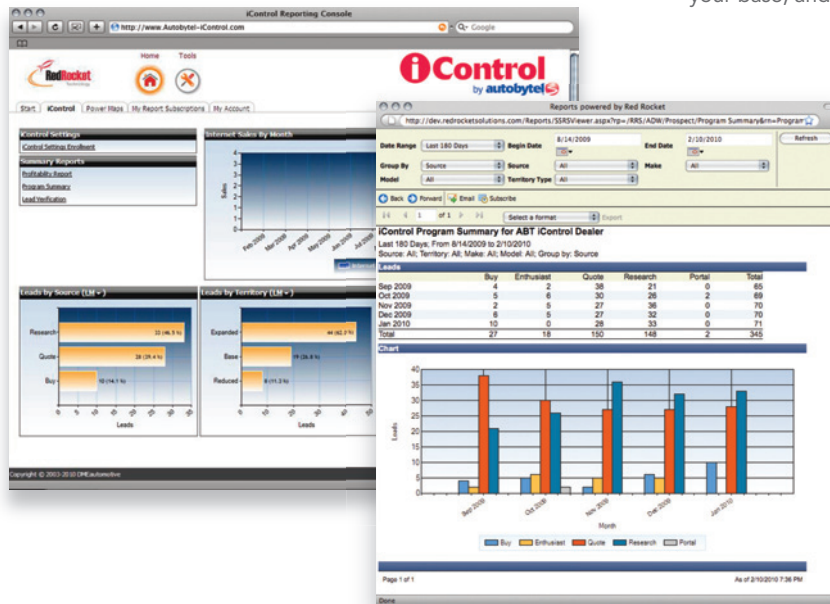
Robust reporting console.

iControl by Autobytel gives you three territories: a Base (usually your PMA/DMA), an Expanded territory beyond your base, and a Reduced territory.